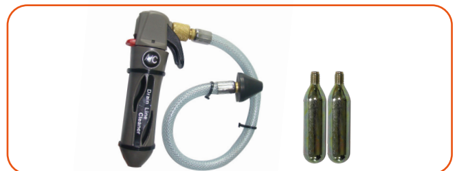
CONDENSATE DRAIN CLEANING TOOL NO. 86001-86004