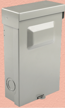
METAL DISCONNECT SWITCHES HOT NO. 15539-15541P