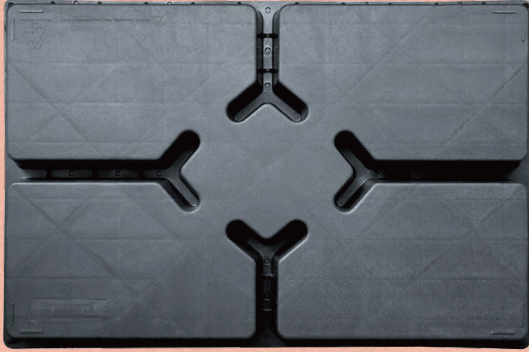
E-Z STACK PAD HOT NO. 18042BS-18074SP