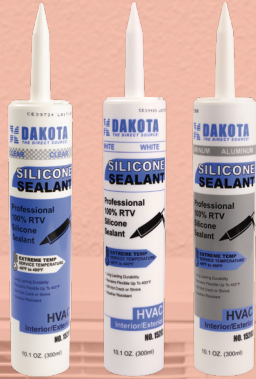
SILICONE SEALANT HOT NO. 15201-15204P