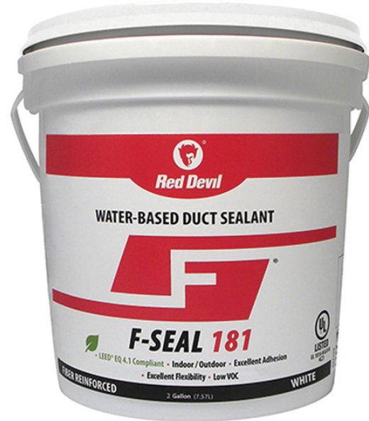
Water Based Duct Sealant